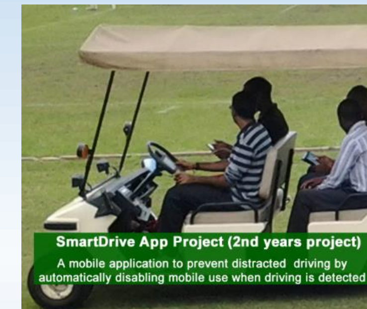
SmartDrive App Project (2nd years project) A mobile application to prevent distracted driving by automatically disabling mobile use when driving is detected.