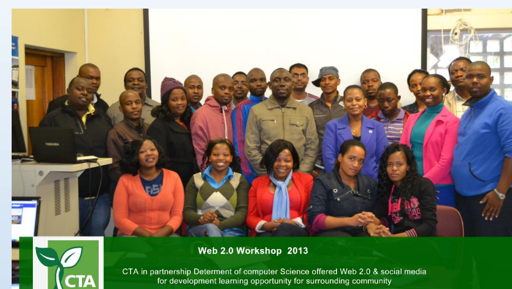
Web 2.0 Workshop 2013 CTA in partnership Department of Computer Science offered Web 2.0 & social media for development learning opportunity for surrounding community