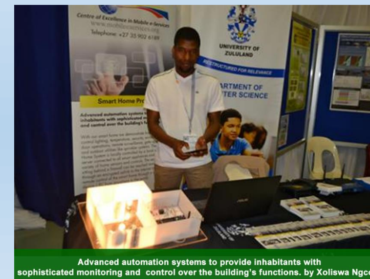
Advanced automation systems to provide inhabitants with sophisticated monitoring and control over the building's functions, by Xoliswa Ngcobo