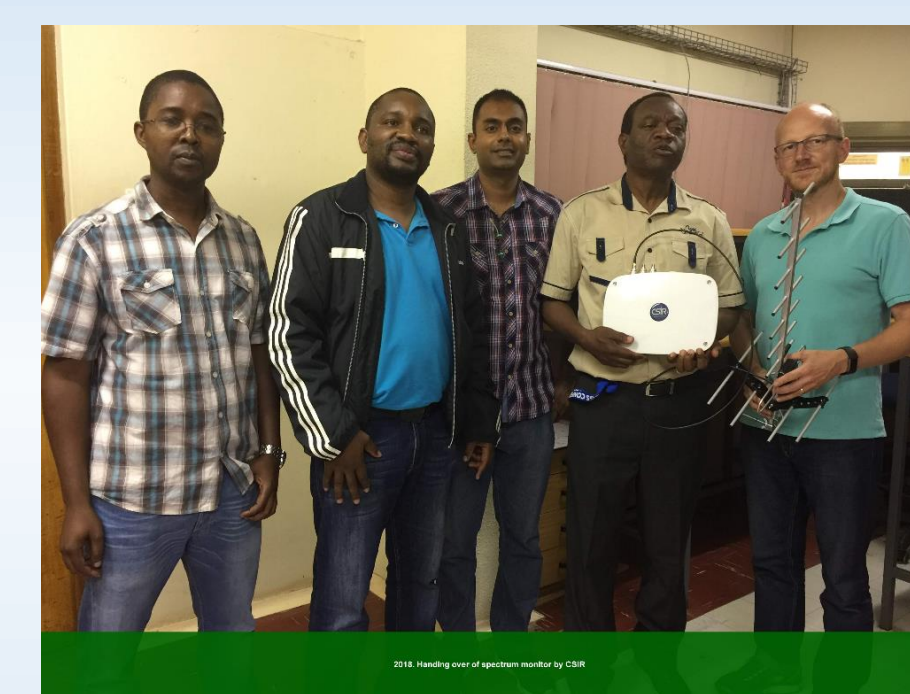
2018: Research centre year end function