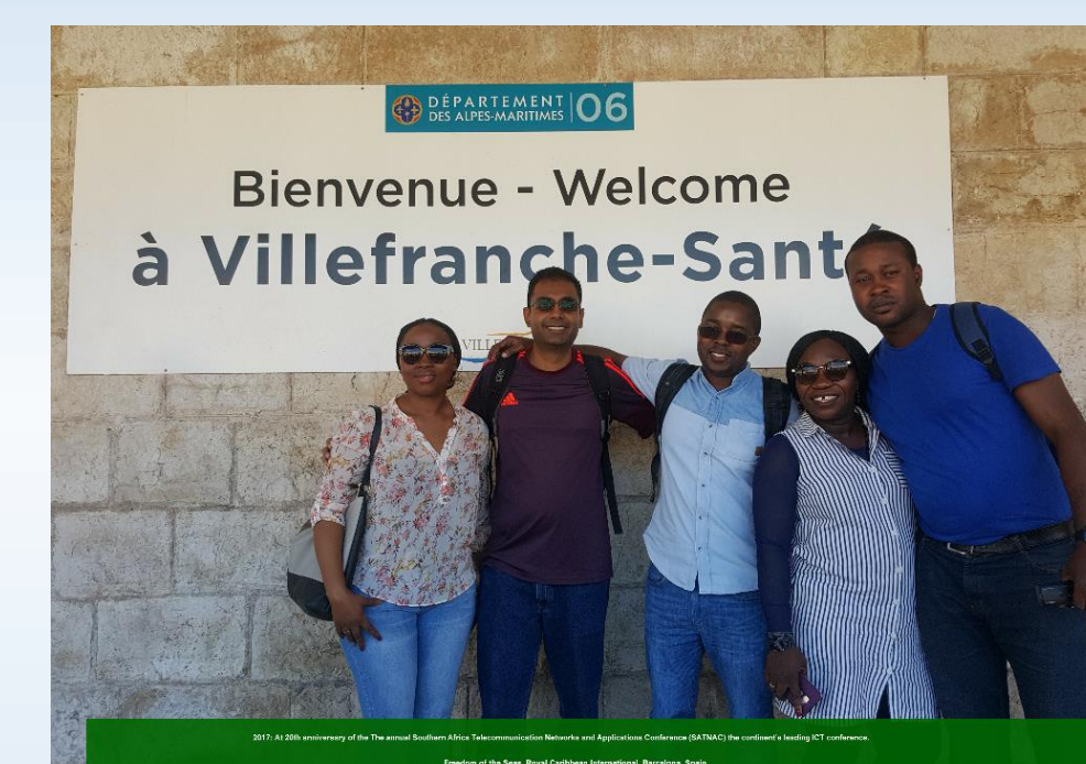
2017: 10th anniversary of the Telkom Centre of Excellence (CoE) at the University of Zululand