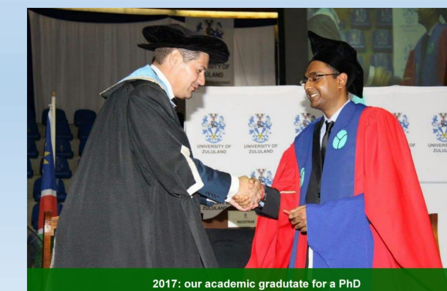
2017: our academic graduate for a PhD