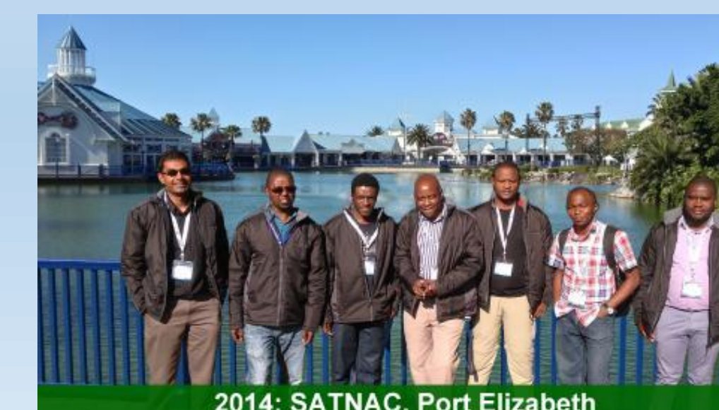
2014: SATNAC, Port Elizabeth