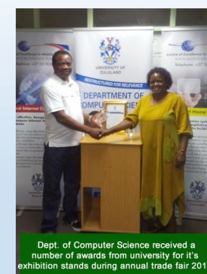
Dept. of Computer Science received a number of awards from university for it's exhibition stands during annual trade fair 2014.