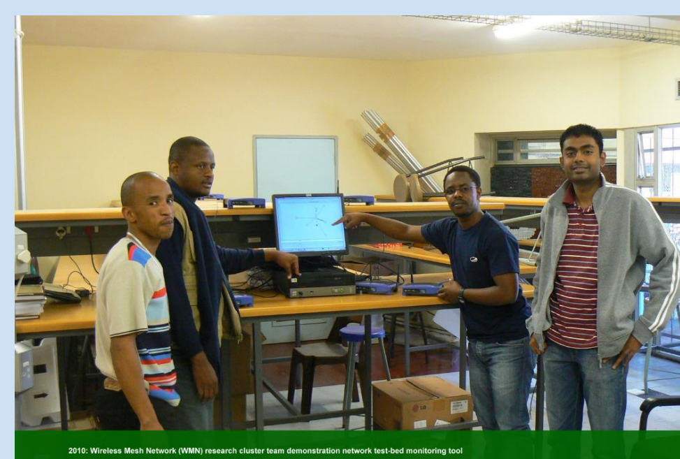
2010: Wireless Mesh Network (WMN) research cluster team demonstration network test-bed monitoring tool