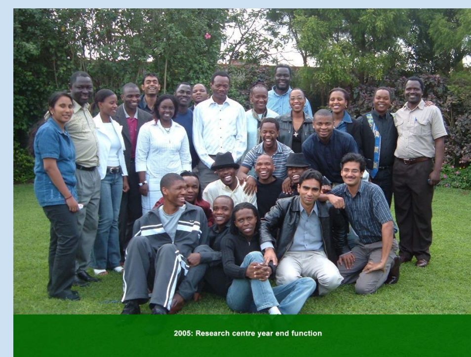
2009: Research centre year end function