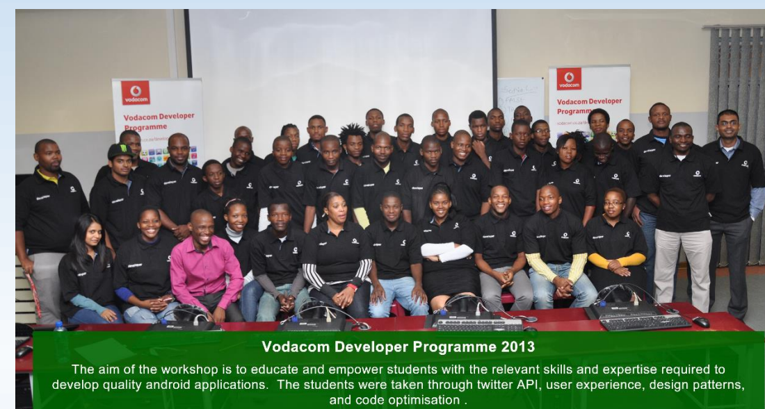
Vodacom Developer Programme 2013 The aim of the workshop is to educate and empower students with the relevant skills and expertise required to develop quality android applications. The students were taken through twitter API, user experience, design patterns, and code optimisation.