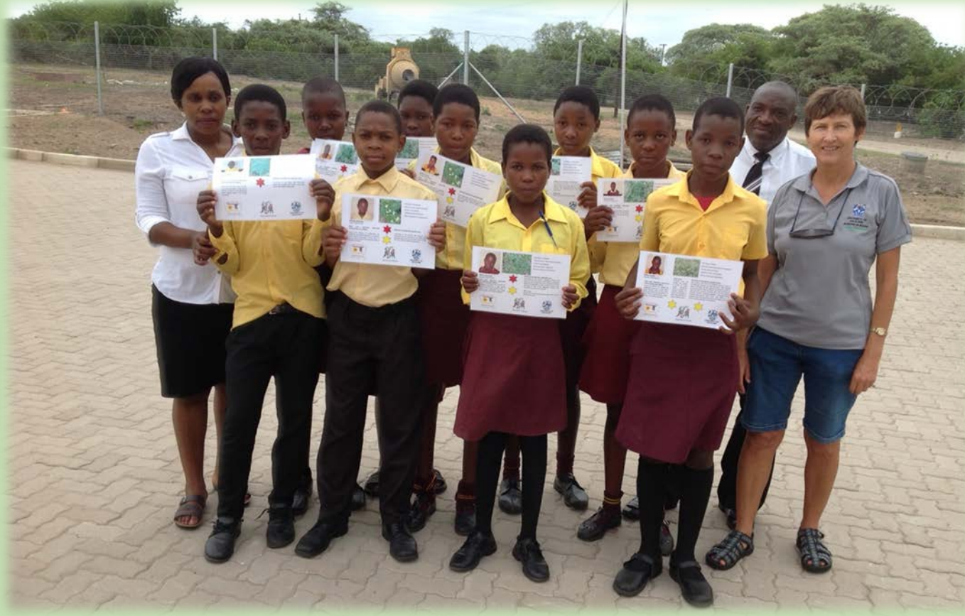
Emfafa school children received certificates for participated in a Departmental research project