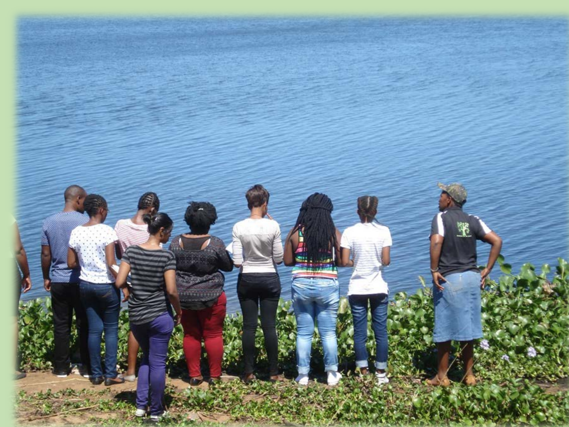
3 rd Years Aquatic and Ecology practical's