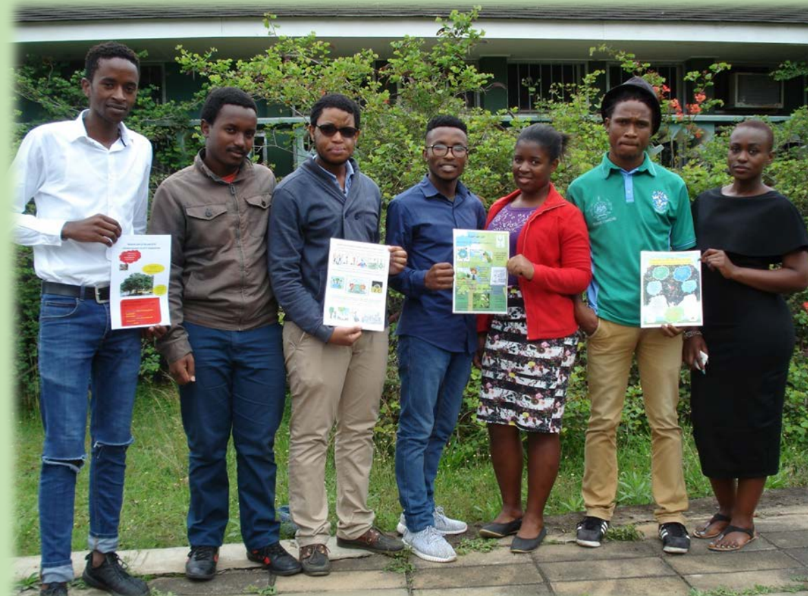
3 rd Years Poster Awards