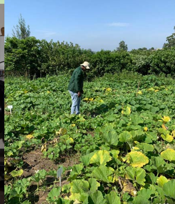
Research on indigenous food plants