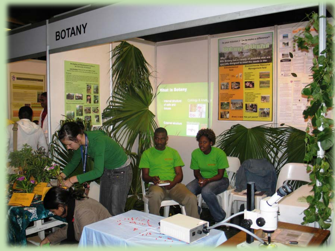
Open day at UNIZULU