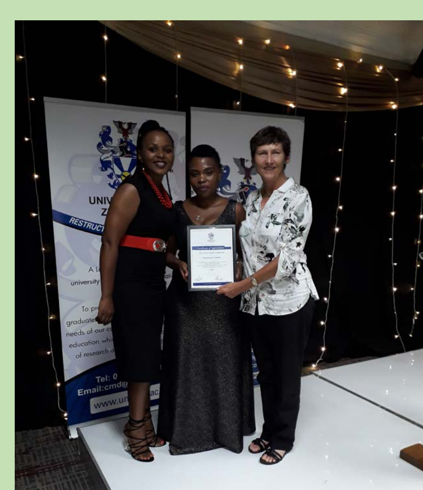
The Department received a research award for productivity