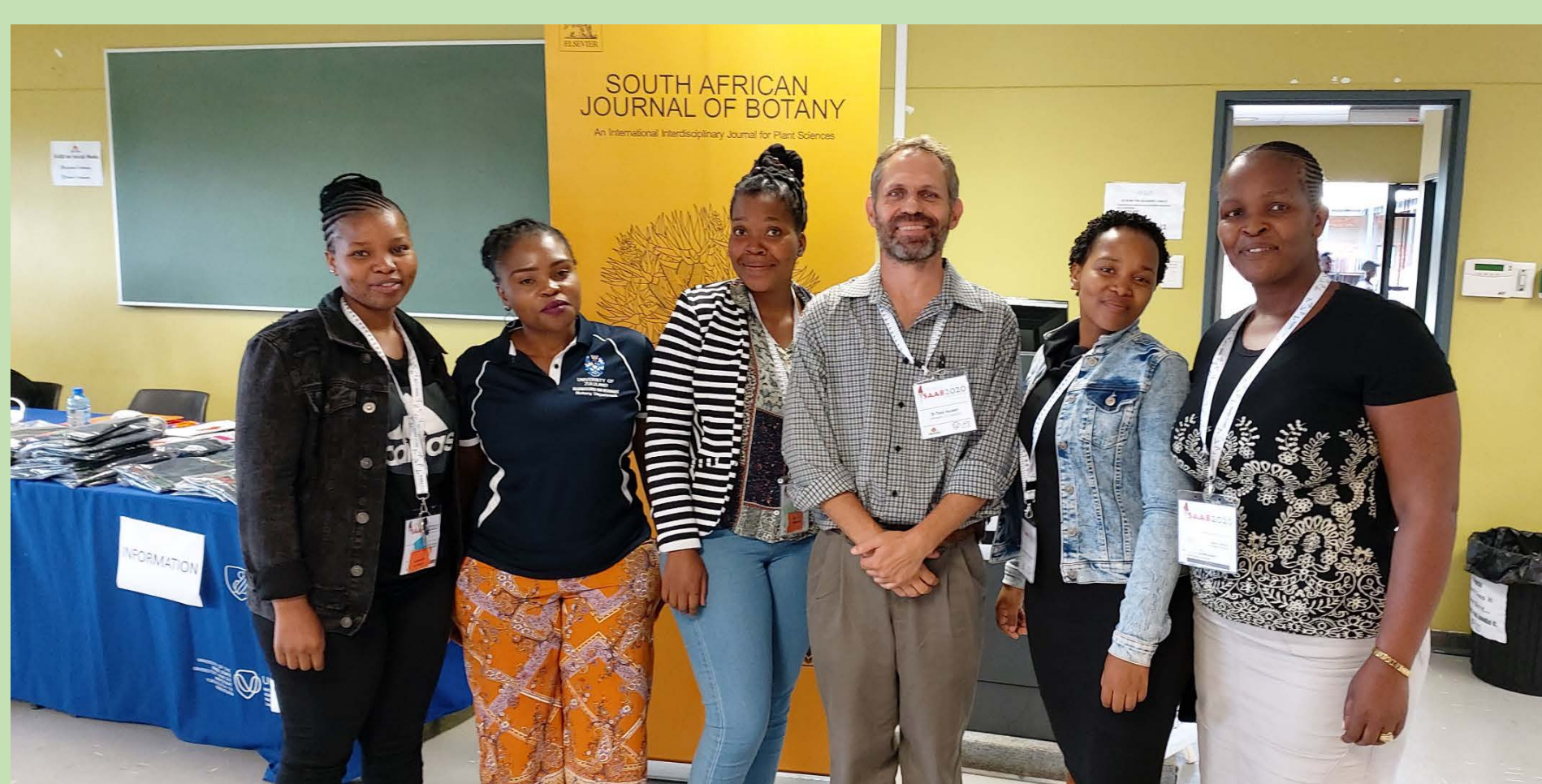
South African Association of Botanist conference