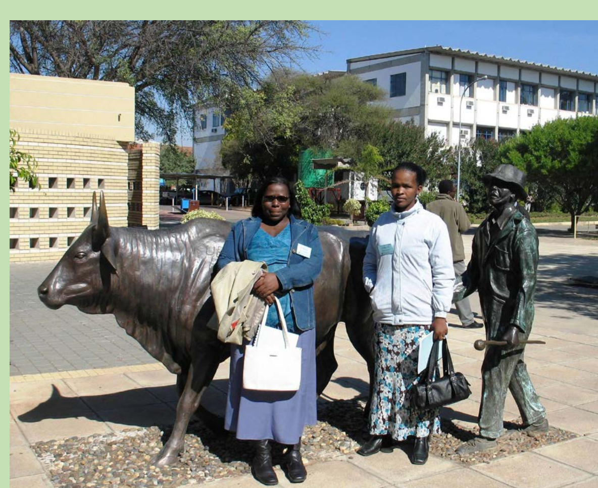
Indigenous Plant Use Forum University of Botswana