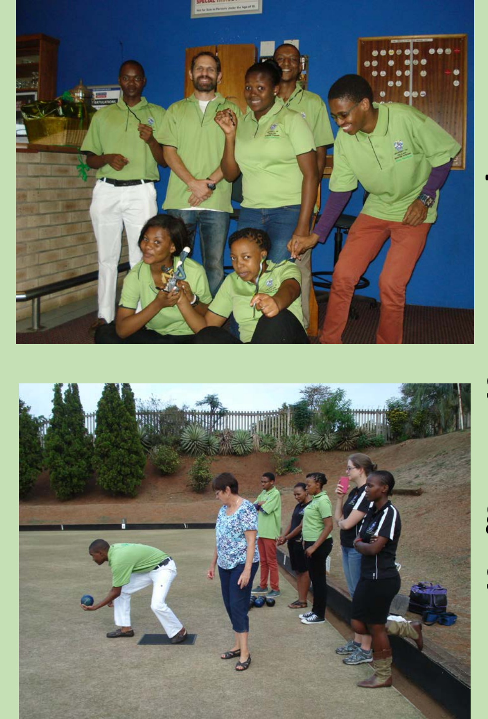
Team building between staff and post graduate students