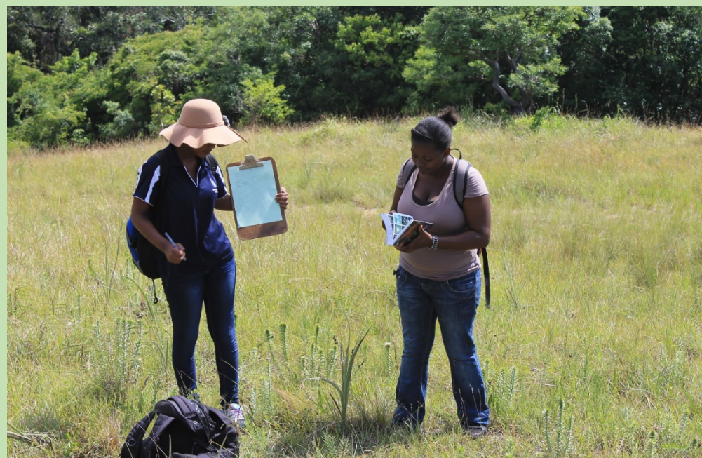
Ecology and Conservation field work