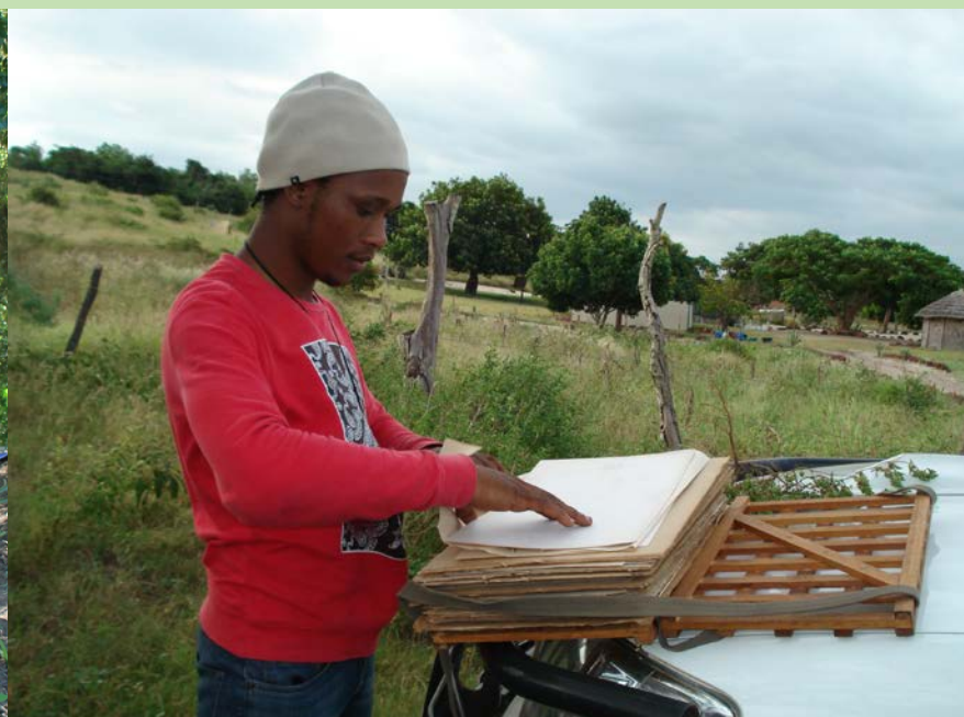
Ethnobotany and Ethnopharmacology research