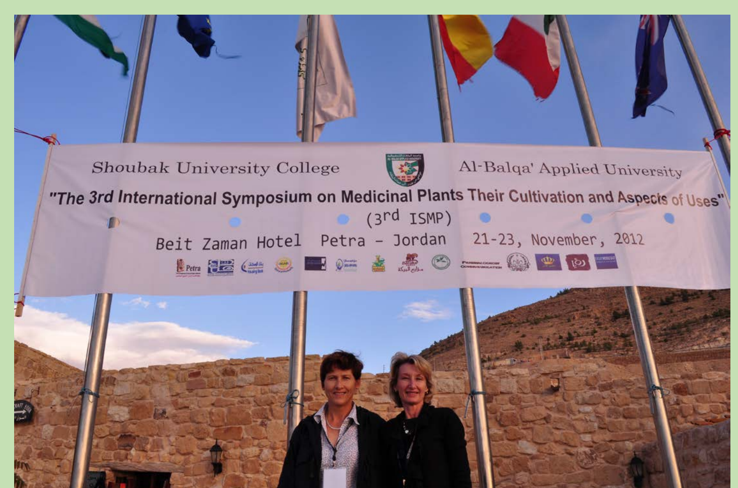
International Symposium on Medicinal Plants - Jordan